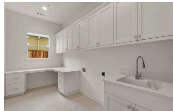
LAUNDRY & YOUR SPACE