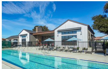
THE CANNERY CLUB