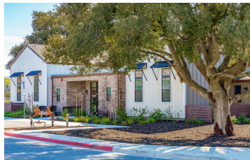
THE CANNERY CLUB