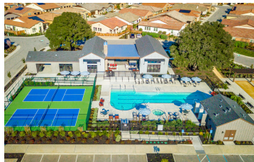
THE CANNERY CLUB