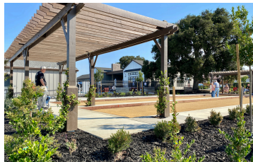
THE CANNERY CLUB