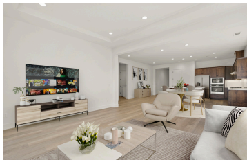
LIVING ROOM & KITCHEN