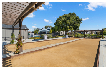
THE CANNERY CLUB