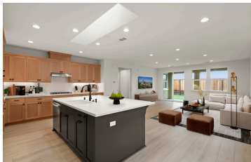
LIVING ROOM & KITCHEN